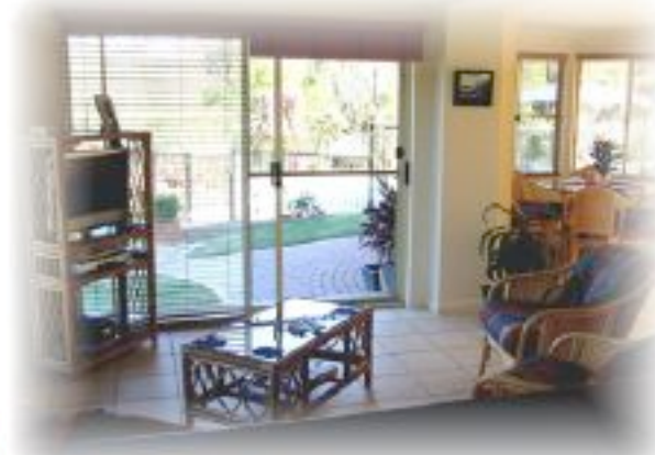
Spacious open plan living area