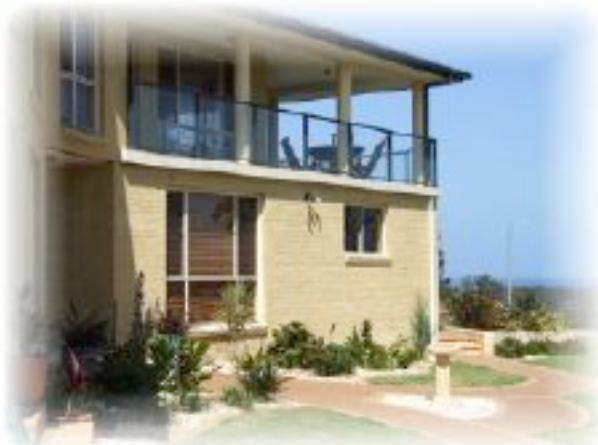
Large landscaped gardens and lawns

Free airport, bus and restaurant transfers